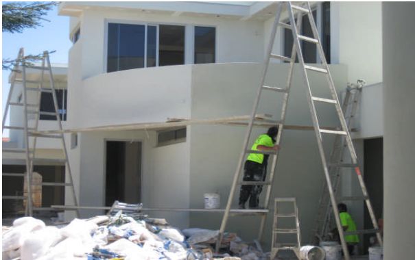
Renderer working on a 2 storey domestic project.