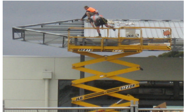
Roof plumbers installing clip lock sheets on canopy of newly built petrol station.